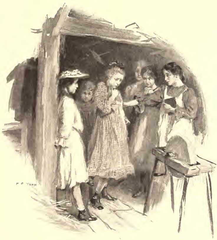
“WE MUST THINK OF IT AS A KIND OF A SIGN”